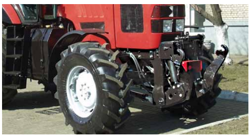
Available front hitch and PTO package